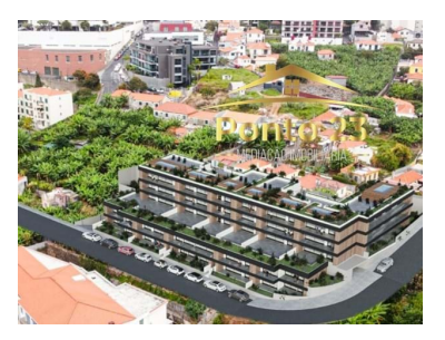
= 3 Bedrooms